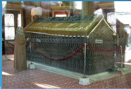
MPF youth camp 1/8/2010

When he was only 21 , he led the Muslim armies under the Ottoman Empire and liberated Constantinople from oppressive rule.